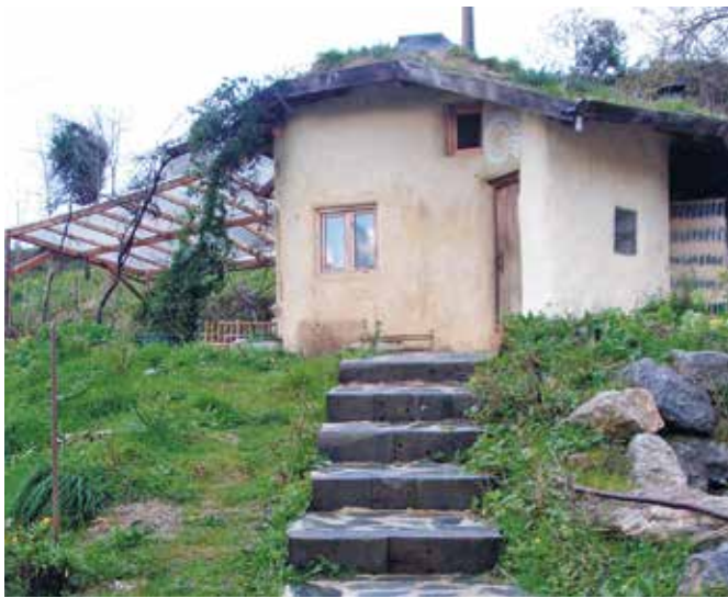
Previous page: Throwing up balls of cobb (inset: Main house). Above: The Snail Cabin allowed testing of techniques later used on the main house. Above right: The completed self-built, dream home. Below: Part of the family-sized kitchen. Bottom right: Cob construction, big and small.

The cost of housing was already a big issue in 1845, when Thoreau noted that the average labourer in Concord, Massachusetts, earned $1 a day, while a typical house cost $800, i.e. two and a half years' wages. He wrote, "Would the savage have been wise to exchange his wigwam for a palace on these terms?" Today, after 170 years of material progress, in real terms our houses cost over four times as much!